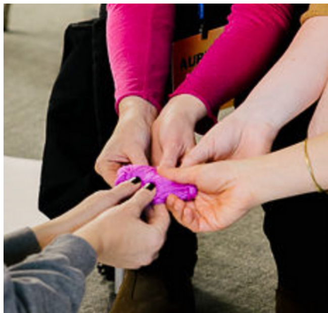
ASO Convergence Image Gallery

This work has strengthened our understanding at a systems level and revealed some of the key polarities that will need to be navigated for us to see progress. For example, from a public funding perspective, ASOs are in direct competition with one another, and yet, we know we need one another to not just survive, but thrive. ASOs: Positioning a Future Forward has given us a way to navigate that tension by inviting arts workers to cluster around community-informed forward actions.